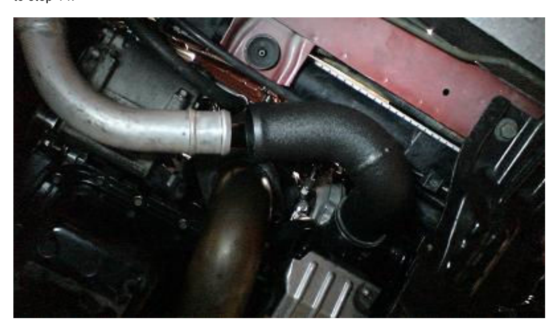
14. Install the 2.5" lower intercooler pipe as shown (join between the compressor discharge pipe and the passenger side of the intercooler).

Note: The supplied compressor discharge pipe is 2.5" diameter where the stock lower intercooler pipe is 1.75" at the connection point. If you purchase the add-on lower intercooler pipe, proceed to step 14.